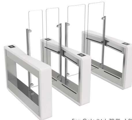
EasyGate IM / 70.9" 1 800 mm