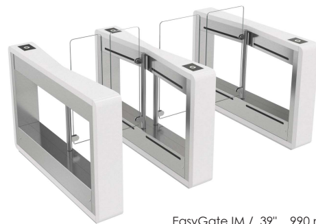
EasyGate IM / 39" 990 mm