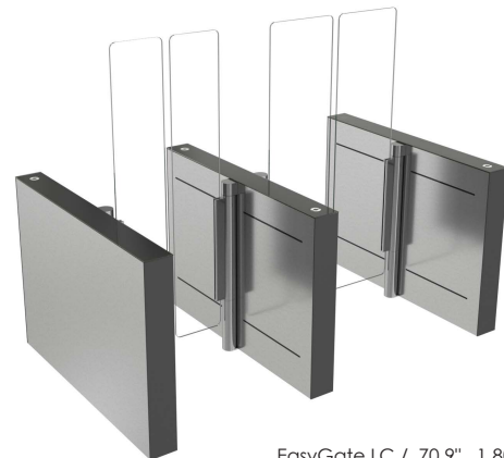
EasyGate LC / 70.9" 1 800 mm