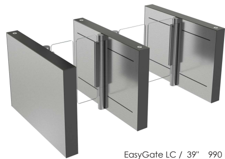
EasyGate LC / 39" 990 mm

Wide passage lane[2] 36.22-41.34" 921-1050 mm Arc layout Staggered / diagonal layout