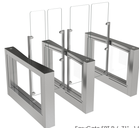
EasyGate SPT-R / 71" 1 800 mm